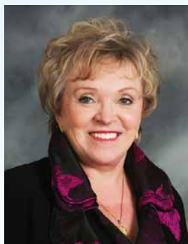
ELIZABETH MORGAN CHAIR