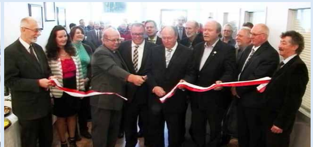
2017 - Chesley Branch opening

We strive to be an unparalleled partner at every stage of our members' lives. Members can contact us in person at our conveniently located branches, as well as online. The goal of opening new branches is to provide our members with more comprehensive support. Our Credit Union's management makes an effort to assure that each branch is functional and modern in design, thereby contributing to the quality of services provided.