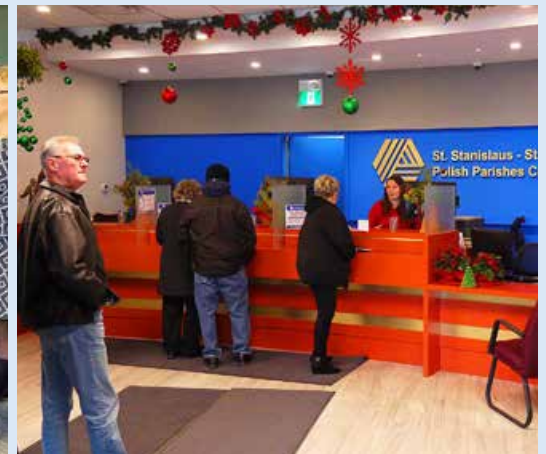
2019 - opening of the Credit Union Dixie branch in Mississauga at 3615 Dixie Road, Unit 1a-2