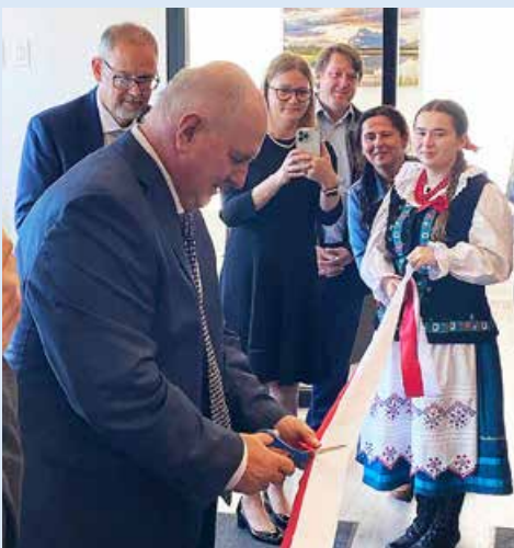
2022 - Milton Branch opening