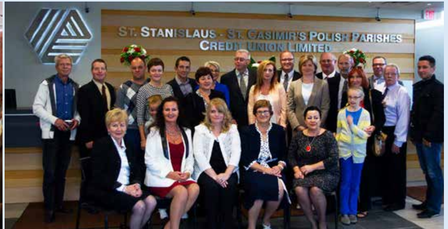
2013 - opening of the Credit Union branch at 4300 Cawthra Road in Mississauga