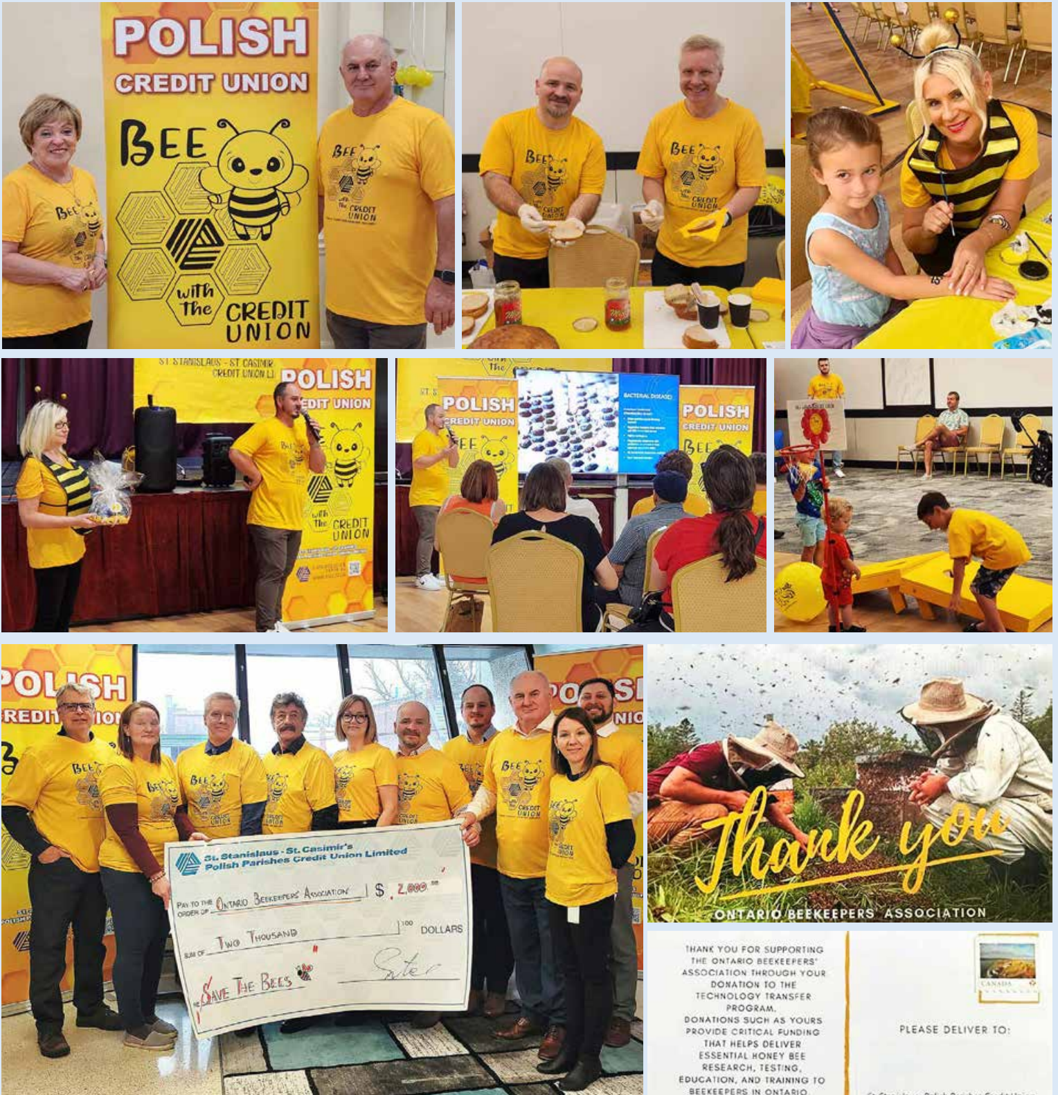
On January, 2023, officials from the Ontario Beekeepers Association (OBA) were presented with a $2,000 donation at the Credit Union's main branch on Roncesvalles Avenue in Toronto.